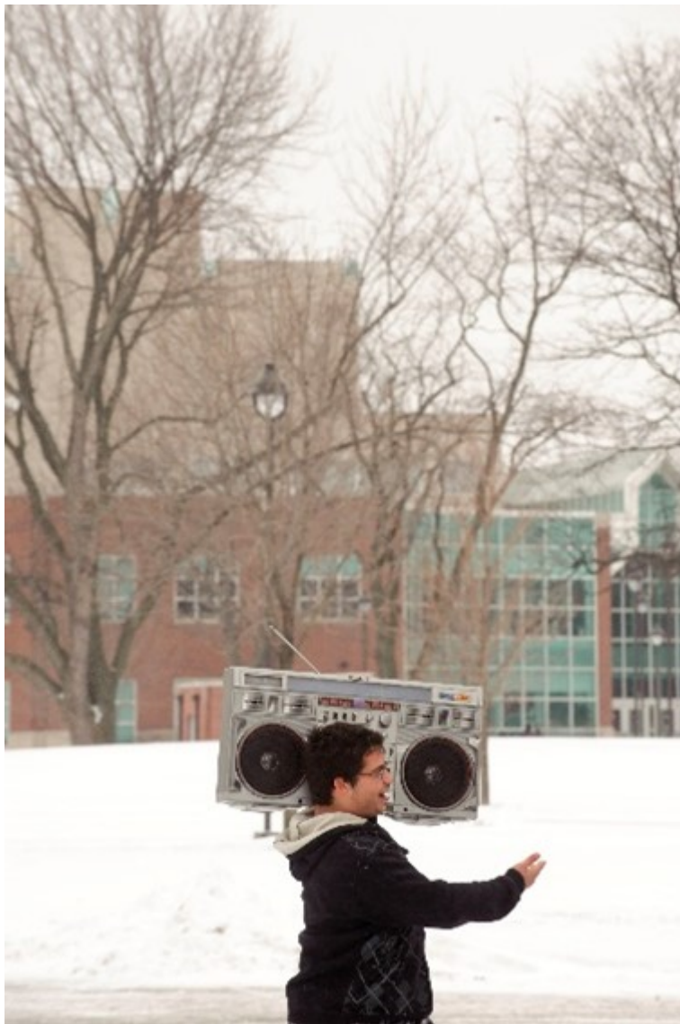
Looking Back - A student carries his portable "boom box" across campus in 2011.