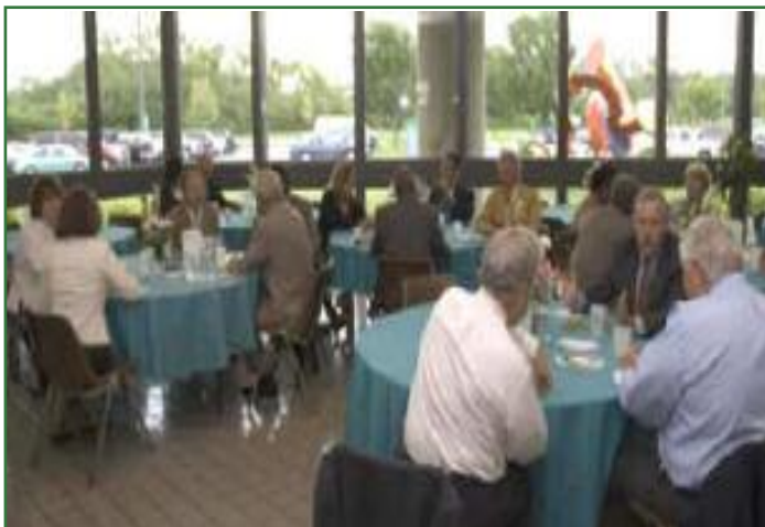
EDCSS sponsors discuss upcoming events at a special sponsor breakfast meeting.