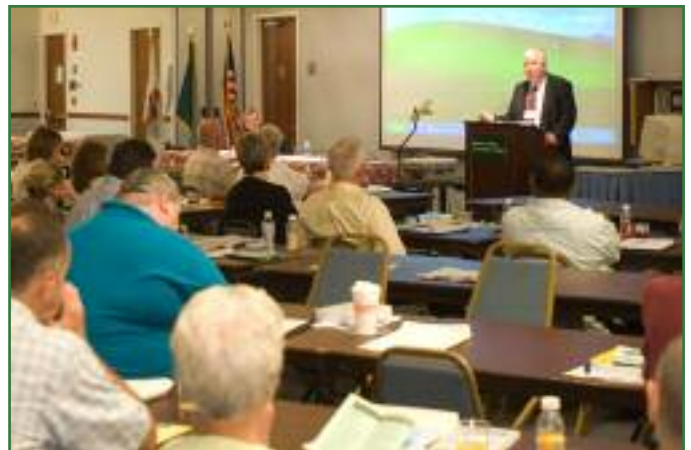
Newly elected and veteran municipal officials attended the Illinois Municipal League conference EDCSS sponsored in partnership with the Southwest Conference of Mayors.