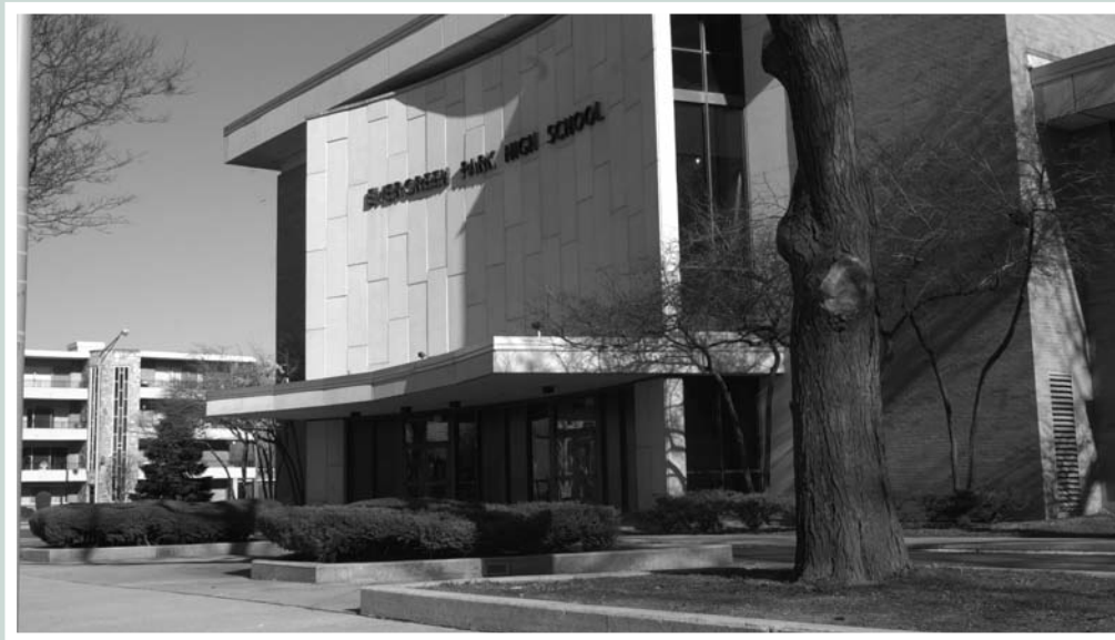
Moraine Valley's extension site at Evergreen Park High School is a convenient choice for local residents.