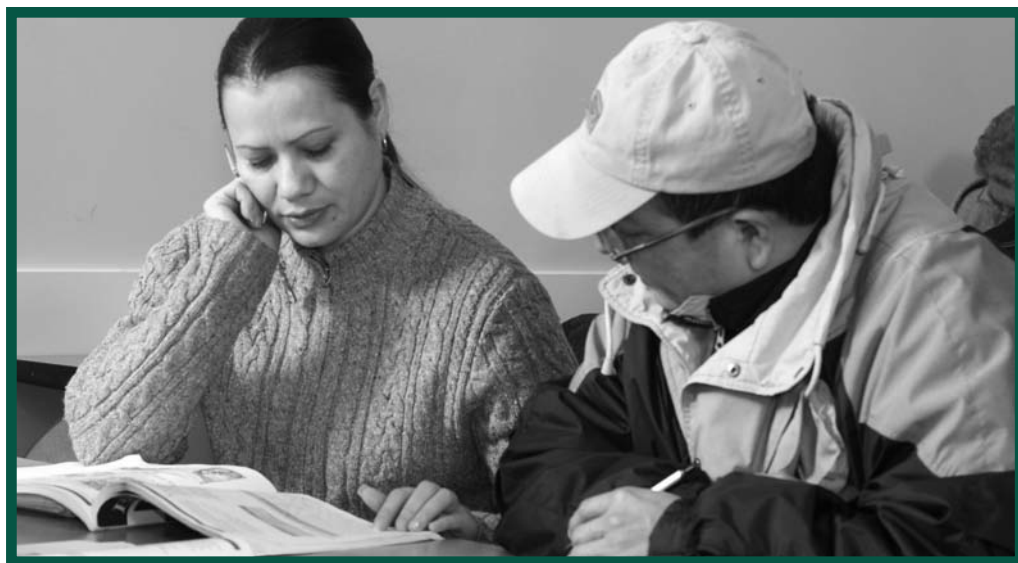
Many amenities are offered at the Moraine Valley Education Center at Blue Island, including a CyberCenter, classrooms wired for the Internet, a student lounge, study area, and free parking.

OSA-100-582 6-6:50 p.m. Mon./Wed. Rm. 103 Starts Aug. 31 8 wks Blue Island Education Center