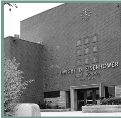
Dwight D. Eisenhower High School is one of several Moraine Valley extension sites.

RDG-091-571 8-9:30 p.m. Tues./Thurs. Rm. 215 Starts Sept. 1 16 wks