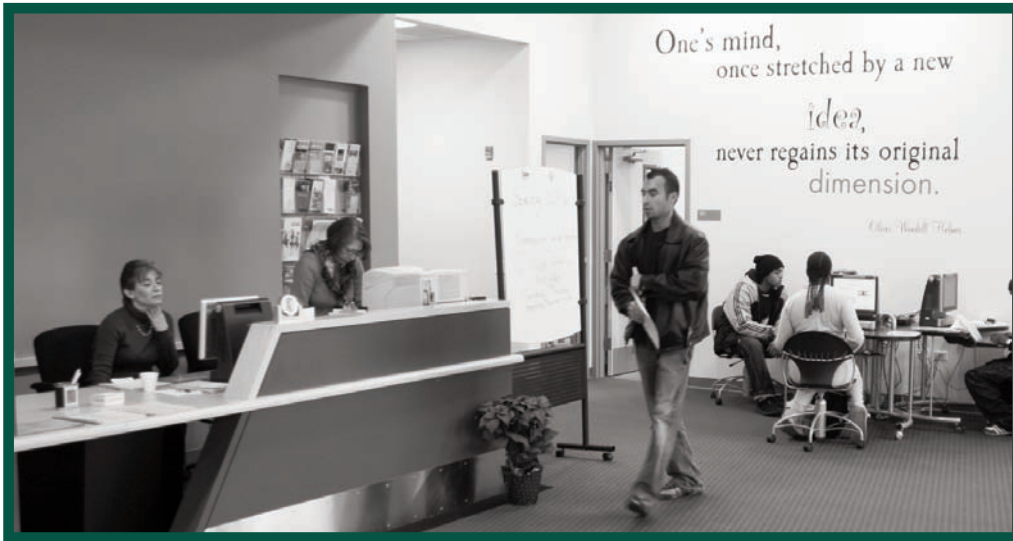
Hundreds of students each semester take advantage of the convenience of the Moraine Valley Education Center at Blue Island, ideally located for residents in the southeast section of our college district.