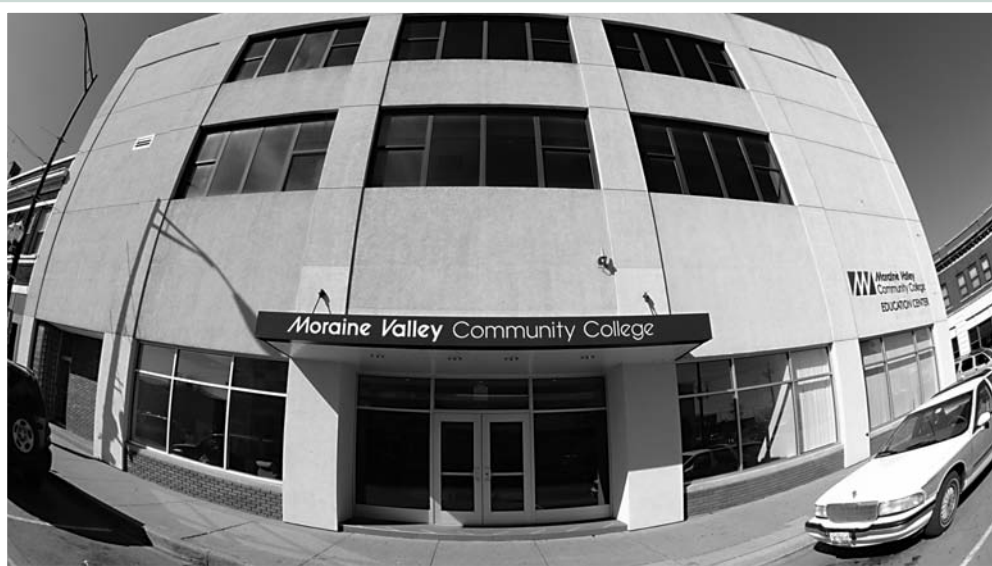
The Moraine Valley Education Center at Blue Island offers daytime, evening and Saturday credit and noncredit classes, allowing students to take classes at a time that works best with their schedule.

Register for classes Aug. 3-7 at the Moraine Valley Education Center at Blue Island and enter the early-bird raffle. You could win a $20 Moraine Valley Bookstore gift certificate and other prizes.