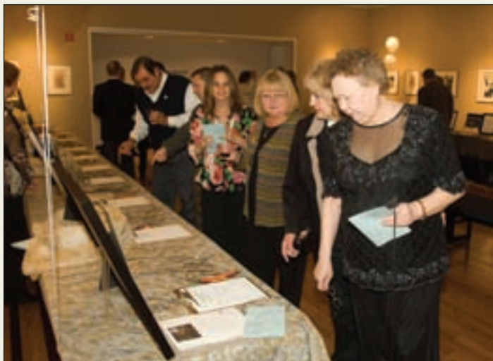
The silent auction helped the Foundation raise additional monies in support of the Fine and Performing Arts Center and student scholarships.

Next year's Starry Starry Night, planned for April 4, 2009, will be a celebration of the 15th anniversary of the event as well as the Fine and Performing Arts Center.