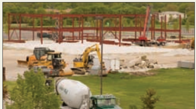
Work continues on the new Moraine Business and Conference Center.

This is the ideal time to make a gift to the college. While the building project is expected to be completed on time and within budget, there are many opportunities for philanthropic investment. The campus expansion project provides buildings, but we are looking to find ways to secure funds for equipment, technology and additional upgrades. For example, a monetary donation for equipment and technology improvements in the nursing and allied health labs will ensure our students continue to be well skilled at providing excellent patient services.